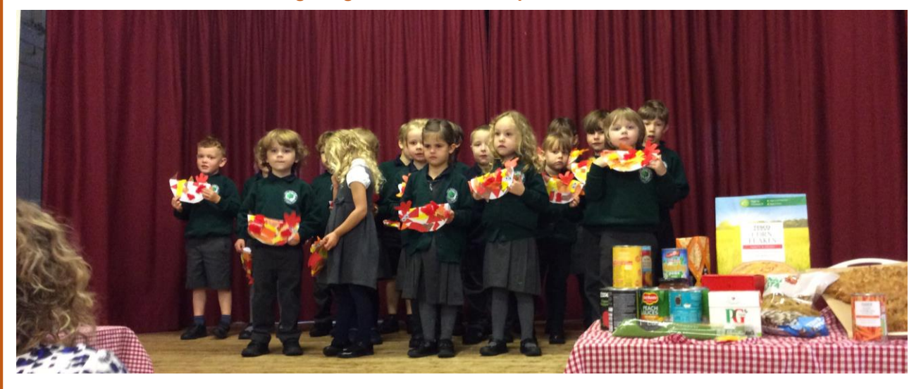
Because of your generosity we were able to give a donation to the Foodbank at Wells Vinyard Church.

Hedgehog class told the story of the Little Red Hen.